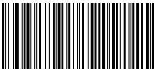
Sense Reading Mode