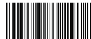
Continuous Reading Mode

In this mode, the scanner is in a continuous scanning mode, it will automatically reads the barcode and outputs information. The same barcode cannot be read more than once unless it is removed and read again.