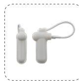
AMtag5 Spider Tag Detection Distance: 1.7-1.9m