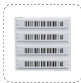
AMtag1 AM Soft tag Detection Distance: 1.3-1.5m