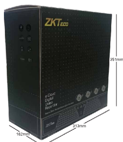
(Come kit - 3.9kg) / (Bullet kit - 4.1kg)