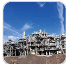
factories and mines