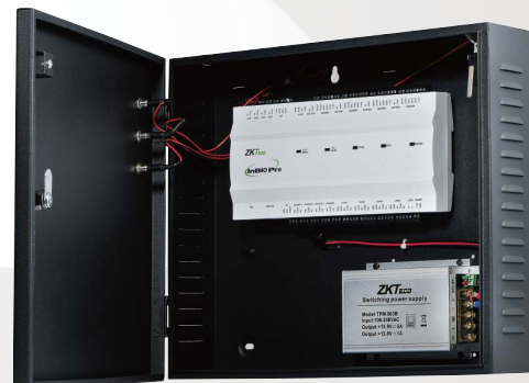
InBio460 Pro Plus Package B

InBio Pro Plus Series is a project oriented, high-end product line with distinctive features, including embedded facial and fingerprint authentication, as well as advanced access control functions. Equipped with TCP/IP, it enables robust remote management and connectivity over local (LAN) and wide area networks (WAN), enhancing deployment flexibility and scalability.