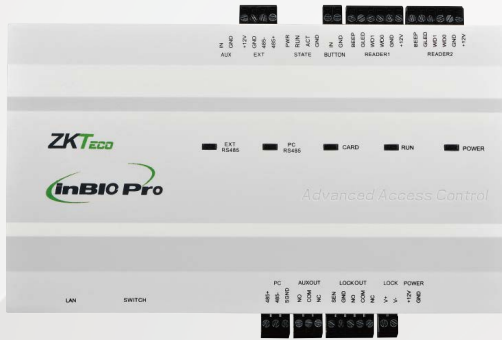
InBio160 Pro Plus