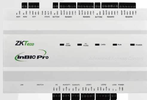
InBio260 Pro Plus