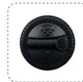
RFtag7 Spider Tag Detection Distance: 1.2 m