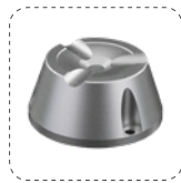
EAS-D10N: Universal Detacher 10000GS