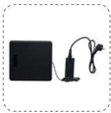
RF-769B RF Deactivator