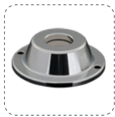
EAS-D01: Normal Detacher 4500GS