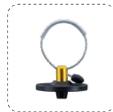
RFtag4 Bottle Tag Detection Distance: 1.5m