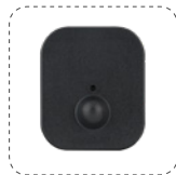
RFtag3 Big Square Detection Distance: 1.8m