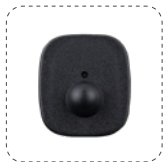
RFtag2 Small Square Detection Distance: 1.4m