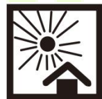
AVOID DIRECT SUNLIGHT EXPOSURE

The effective measuring angle of the temperature detection equipment is 25 degrees upward, downward, left, and right direction. Within this range, reflective objects/high-temperature heat sources should be avoided as much as possible. For example, glass, ceramic tile, metal, automobile, etc. The device's thermal imaging module can capture the reference objects within 10m. When the person crosses these reference objects and reaches the effective temperature detection distance, it is possible to detect the temperature of the reference body surface when the person passes the device in less than 0.1s, resulting in inaccurate temperature detection data. If the above situation exists, it is recommended that the person can stand in front of the device within the effective temperature detection distance for more than 0.5s to measure the temperature, so that the module can precisely capture the person's face and then measure the temperature accurately.