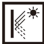
AVOID GLASS REFLECTION