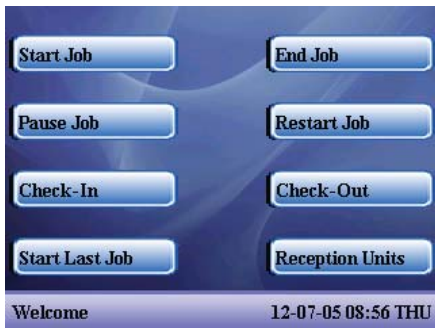
Function keys definition