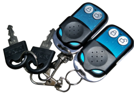
Remote control and keys