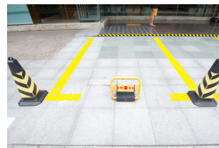
Private parking management