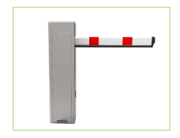
PB Series Automatic Barrier